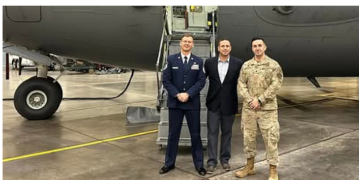
WREATHS ACROSS AMERICA WITH ORANGE COUNTY VETERANS SERVICE AGENCY