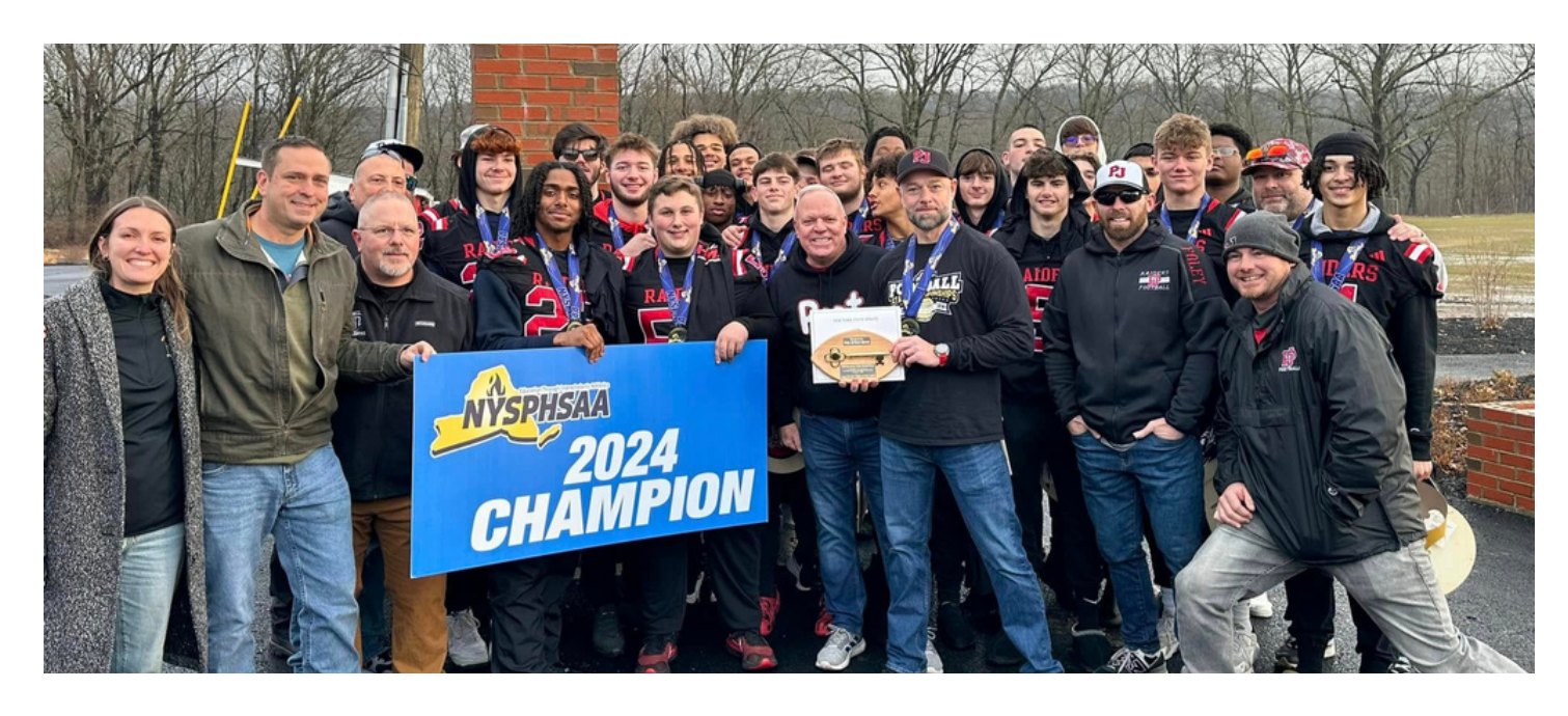
IN SCOTCHTOWN BACKYARD